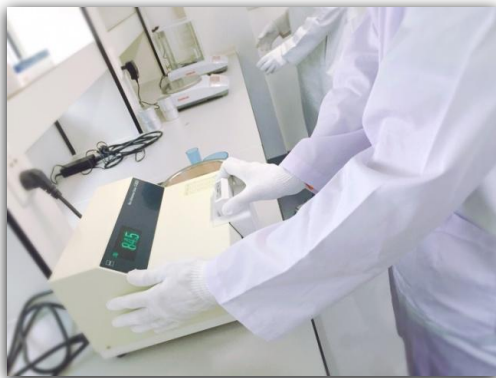
Whiteness Meter for whiteness testing for Rice