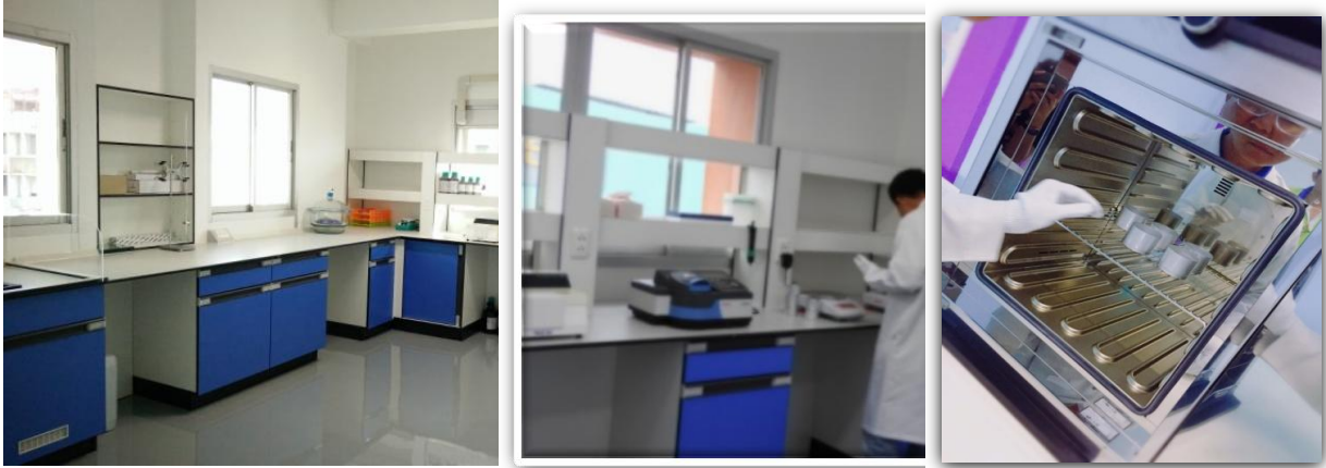
Oven for Moisture Content analysis

A good example of a TCIS laboratory having the latest and most advanced equipment for specific testing and analysis is our laboratory in Thailand.