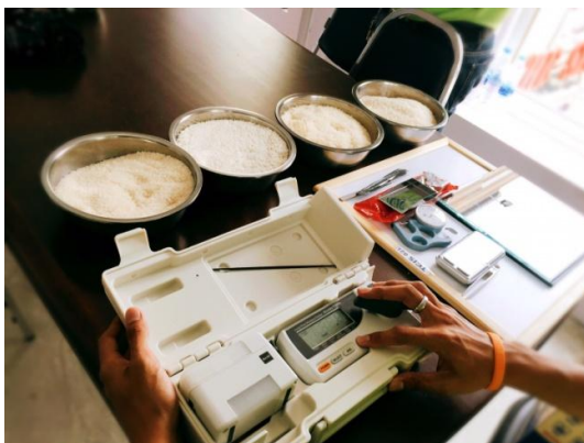
Moisture analyzer for inspectors to test moisture