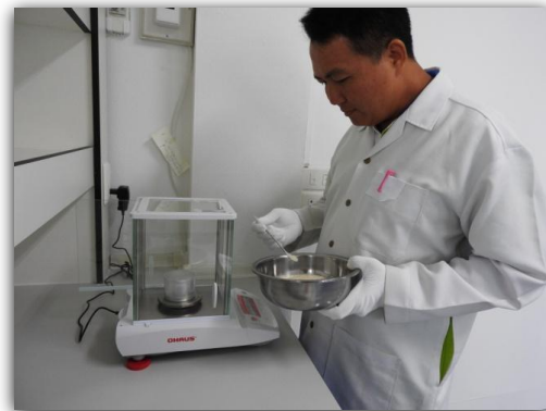
Balance for sample weight, sample and chemical preparation